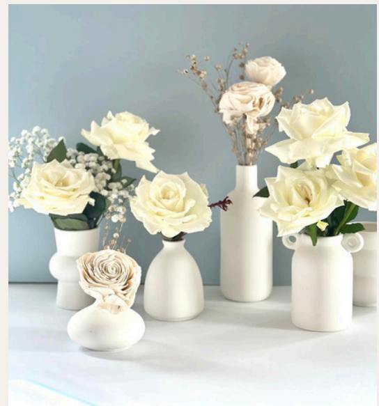
MODERN SOHO MIX