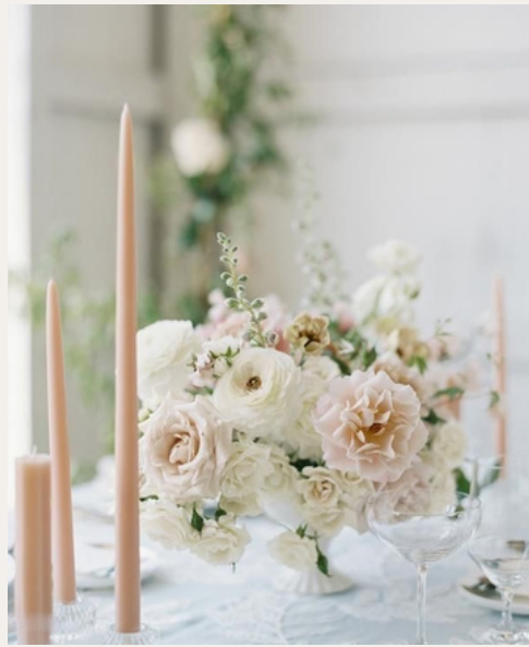
CLEMENTINE GARDEN VASE